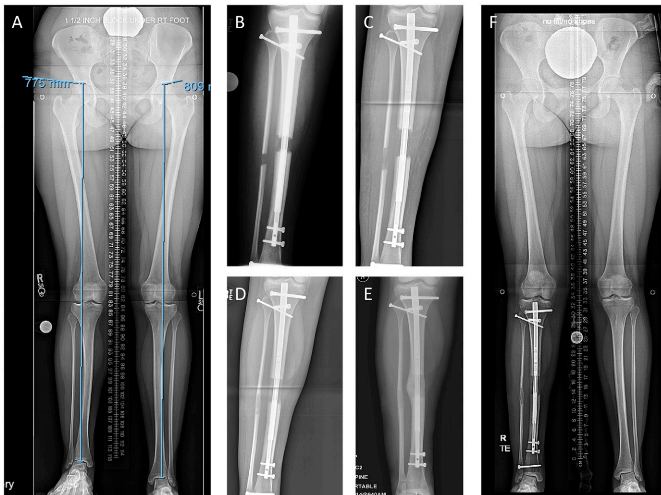
Fig. 1 Radiographic presentation of each phase of distraction. Fig. 1A Preoperative imaging demonstrating a limb-length discrepancy due to right tibial shortening. Fig. 1B Early distraction. Fig. 1C Late distraction. Fig. 1D Early consolidation. Fig. 1E Late consolidation, with evident osseous union. Fig. 1F Full-length radiograph demonstrating that the limb-length discrepancy has been corrected.

latency, distraction, and consolidation 3,4 . In latency, the primary inflammatory response occurs immediately following surgical osteotomy, a process that is similar after fracture. The period of time allowed for latency is clinically determined on the basis of the patient's healing potential and may last from three to ten days (e.g., pediatric patients require less time in latency) 5-7 . In distraction, the callus is subjected to mechanical forces, forming a fibrous interzone 1,8,9 characterized by active chondrocyte-like cells, osteoblasts, and fibroblasts. On radiographic examination during distraction, callus formation can be detected three to six weeks after distraction initiation (Fig. 1B and Fig. 1C) 10 . Of note, the